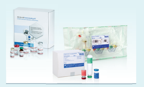
Reagent Sets + Cassettes